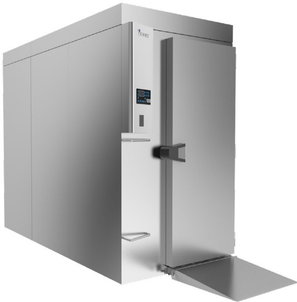
Note: Shown With Optional Ramp